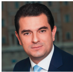
Kostas Skrekas MP, New Democracy Party former Minister of Development & Competitiveness