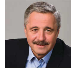
Yannis Maniatis MP Democratic Coalition, f. Minister of Environment & Energy